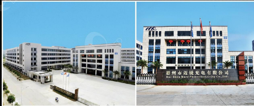
M.R Industrial Park ▲

Shenzhen Mary Photoelectricity Co.,Ltd (MRLED) is a subsidiary of state-owned company-- Fujian FURI Electronics Co.,Ltd (Stock code : 600203). MR LED was established in April,2006 and is a national Hi-tech enterprise which specializes in researching, designing, manufacturing , selling and servicing all kinds of led displays.